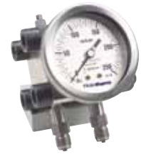
Differential Pressure Gauges

output signal by utilising a diaphragm strain gauge mounted with an amplifier in a stainless steel housing. These reliable instruments are rugged and easy to install.