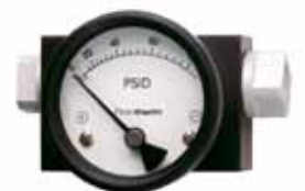
Differential Pressure Gauges