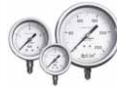
RPG Process Gauges