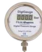
DigiGauge Digital Pressure Gauges