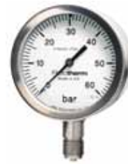
SPG Elite Safety Pattern Pressure