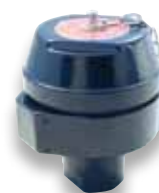
Cast Iron H70 Head Standard Lid