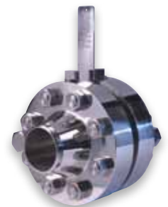
Orifice Flange Assembly