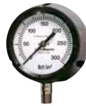
Turret Style Safety Pattern Gauges