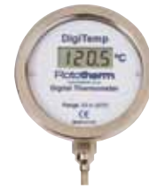
DigiTemp Digital Thermometers