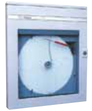
RPO / RTO Recorder

proven and reliable Rototherm stainless steel thermal system. Up to three pens can be fitted with three temperature systems or a combination of temperature and pressure systems.