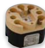
Model TR48 Temperature Transmitter