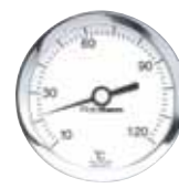
Surface Bimetallic Thermometers