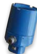
Cast Iron H70 Head Glass Window