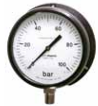
DMC Cased Safety Pattern Gauges