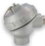
Model KNY Connection Head