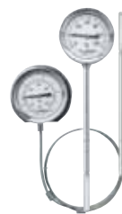
Filled System Thermometers