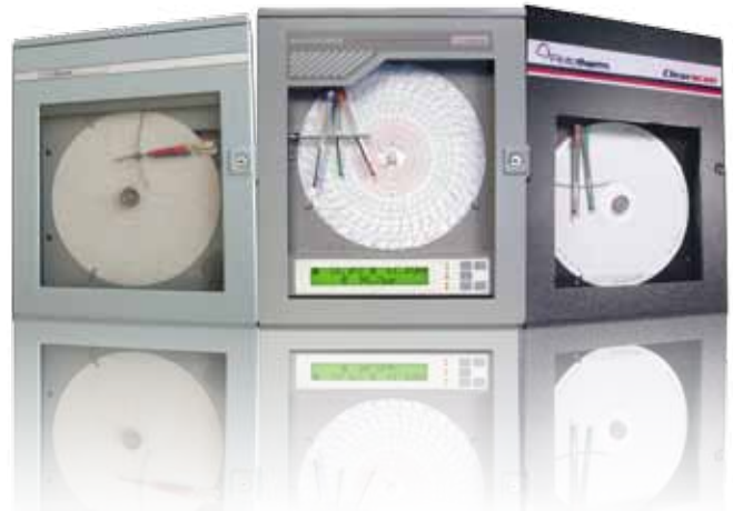
(from left to right) Model RPO Pressure Recorder, Sentinel Chart Recorder & Clearscan Chart Recorder

The RPO series of pressure circular chart recorders uses the well proven and reliable Rototherm non ferrous or stainless steel pressure system. The RTO range of temperature circular chart recorders uses the well