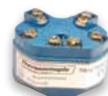
Model TR12 Digital Temperature Transmitter