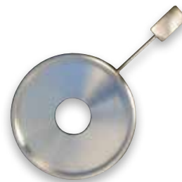
RTJ Type Orifice Plate