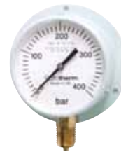
SPGA Aluminium Cased Safety Pattern Gauges