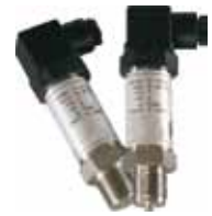
PTX Pressure Transmitters